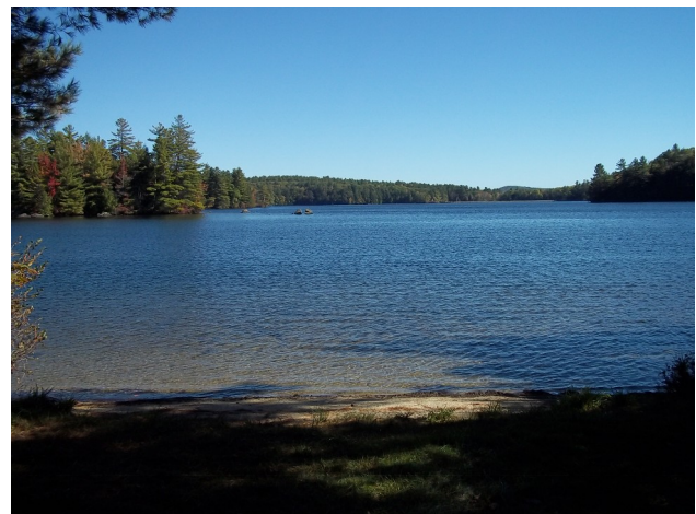
View of lake from the beach